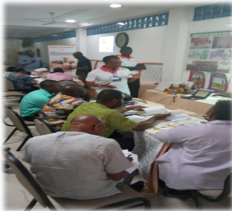
ICDP PARTICIPATES IN THE NGO FORUM ORGANISED BY USAID