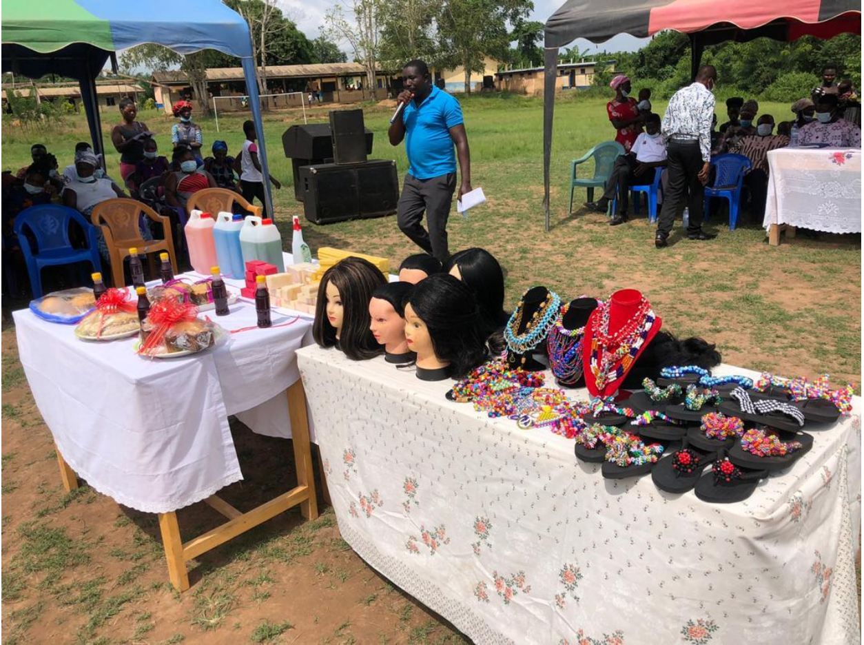
Figure 7: STAGE graduation ceremony in Addo Nkwanta