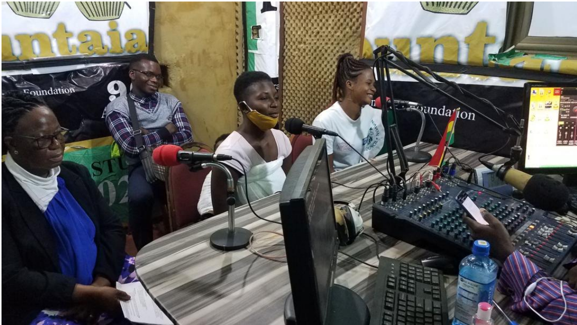
Figure 4:GAA Youth Advocates and the Girl Child Officer (Akuapem North) during one of the Radio programmes

medium. 3 Youth Advocates from Eastern Region intensified their activism by organizing a Radio Sensitization Programme to educate community members on Cyber bullying and CSEC at Radio Mountains at Adukrom in the Okere District on 16th June 2020.