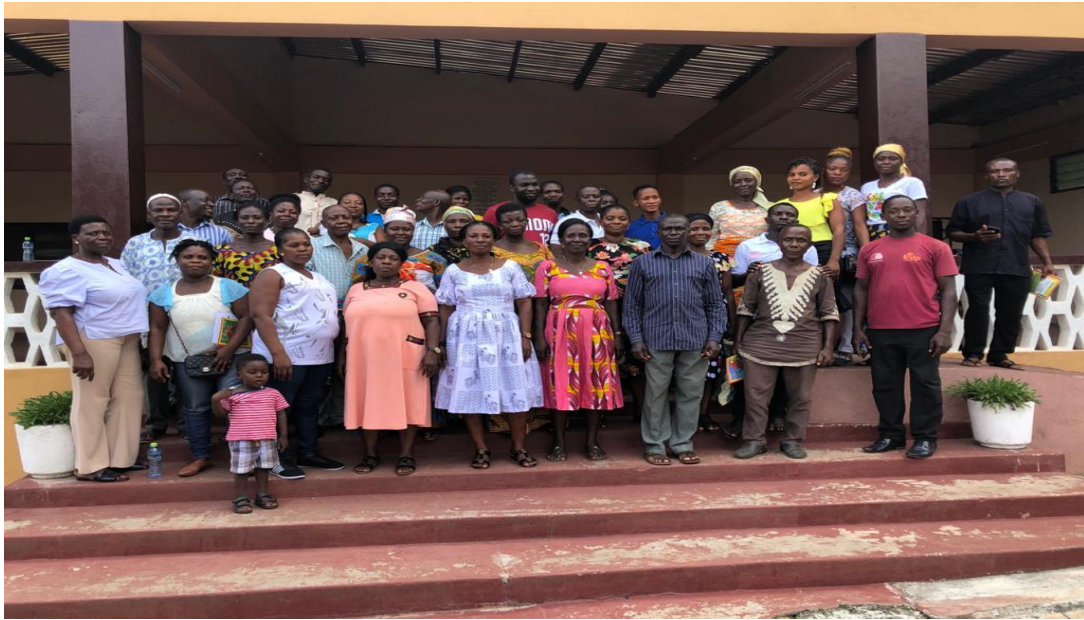
Figure 1: COC TRAINING IN AKROPONG