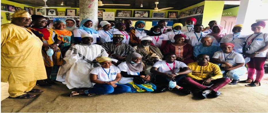
Figure 5: National Youth Advocates presents a petition on Ending Child Marriage to the National Chief Imam.