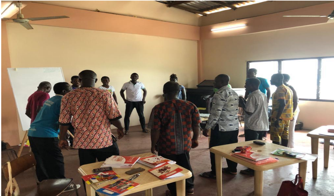
Figure 3: facilitators training