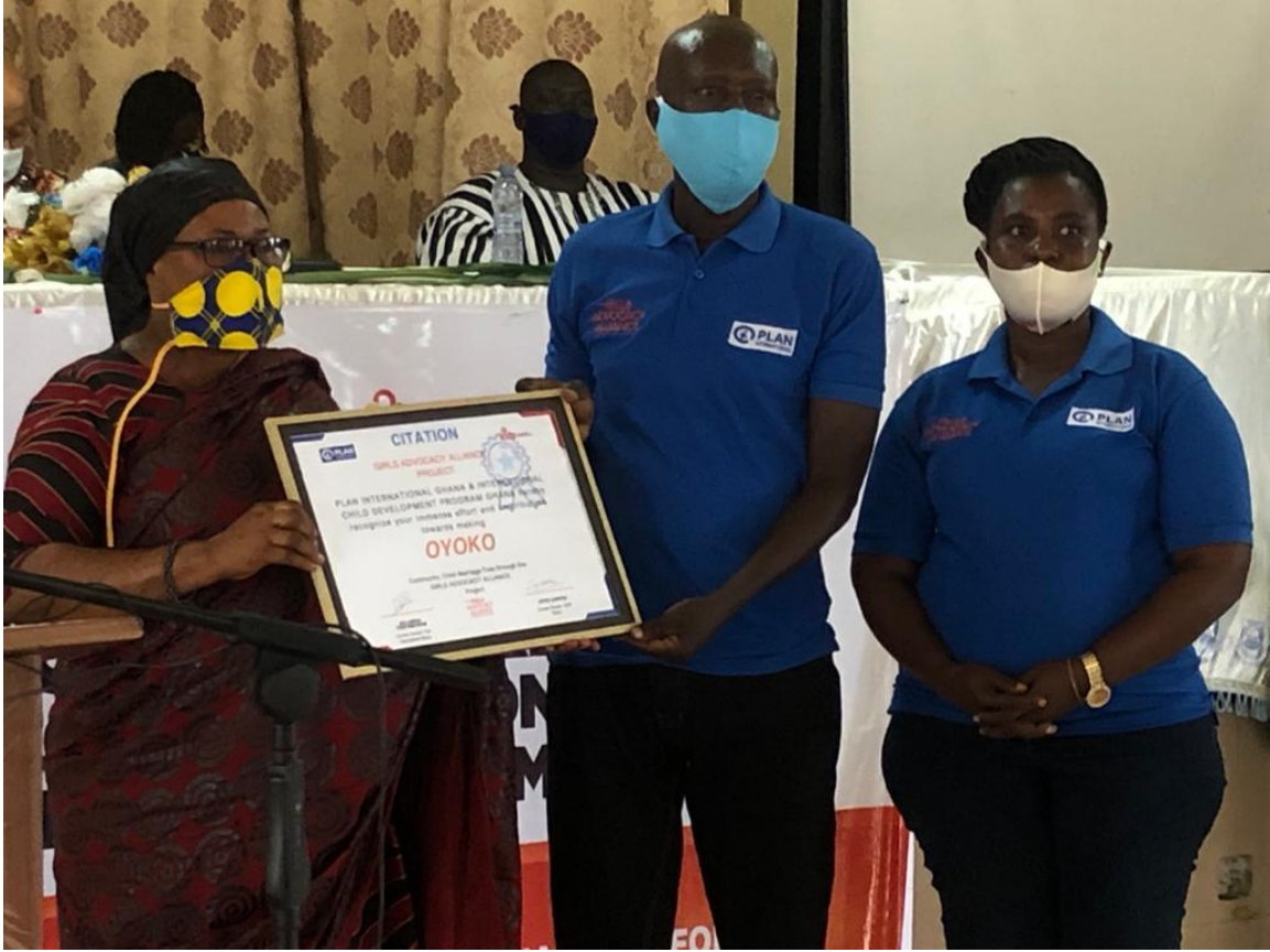
Figure 6: Community leaders from Oyoko receiving a plaque declaring their community child marriage free.