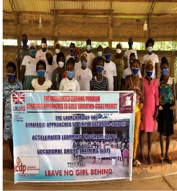
PICS OF STAGE BENEFICIARY WHO ARE GIRLS AND YOUNG WOMEN