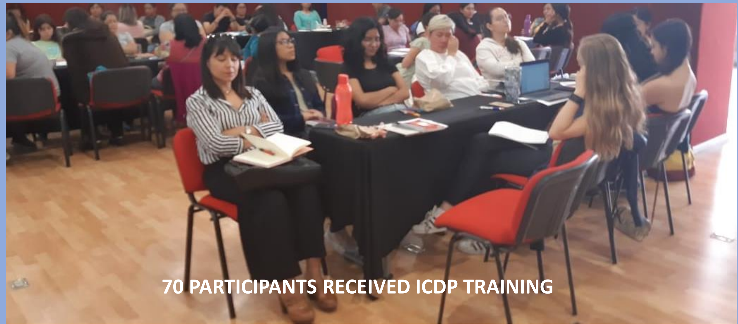
70 PARTICIPANTS RECEIVED ICDP TRAINING